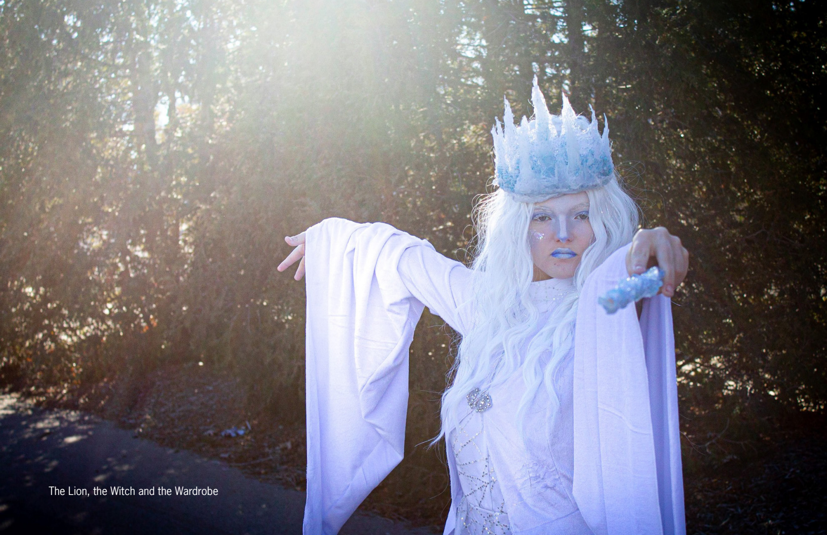
The Lion, the Witch and the Wardrobe