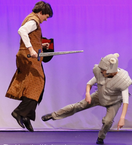
The Lion, the Witch and the Wardrobe