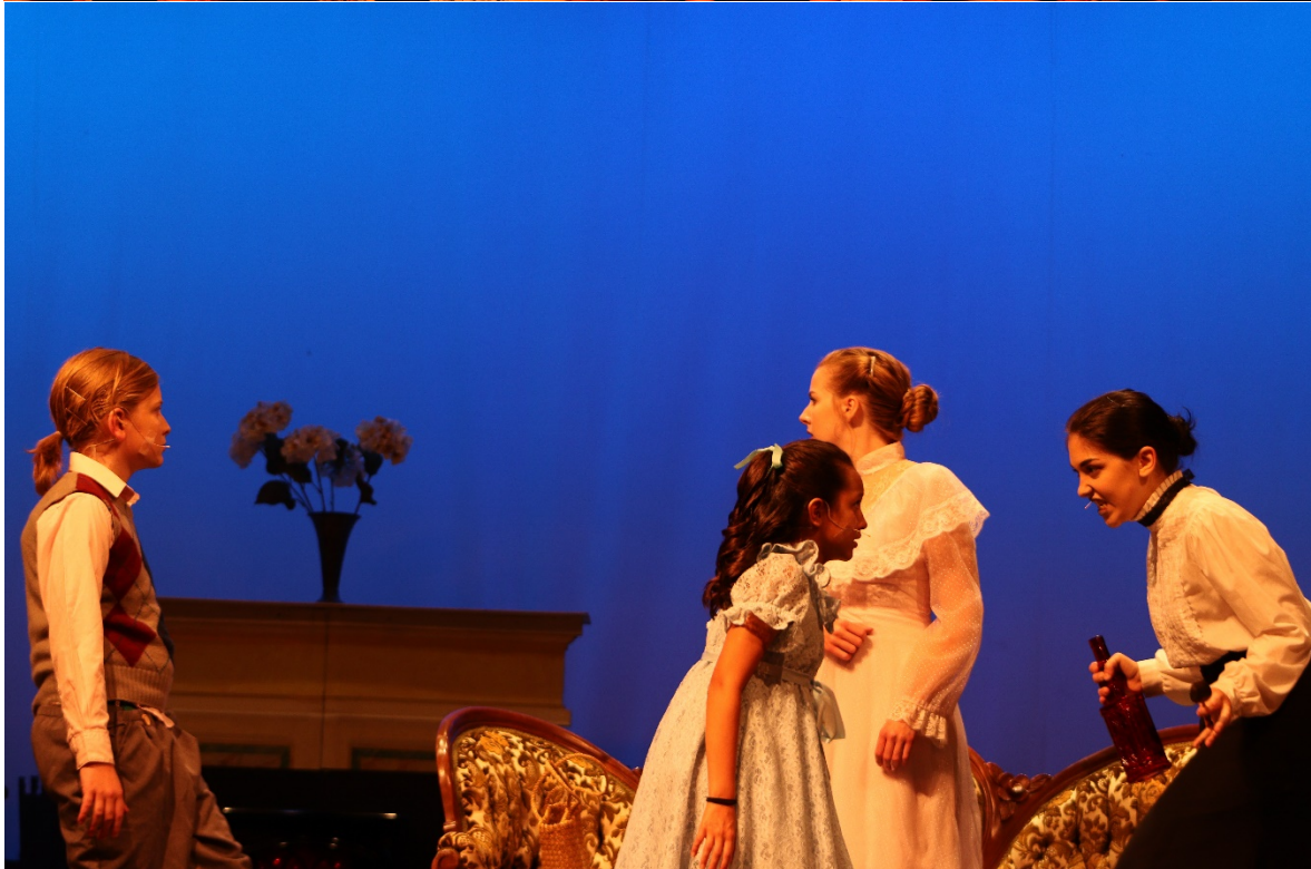
Show photos courtesy Teriah Fleming (Teriah Nicole Artistry)