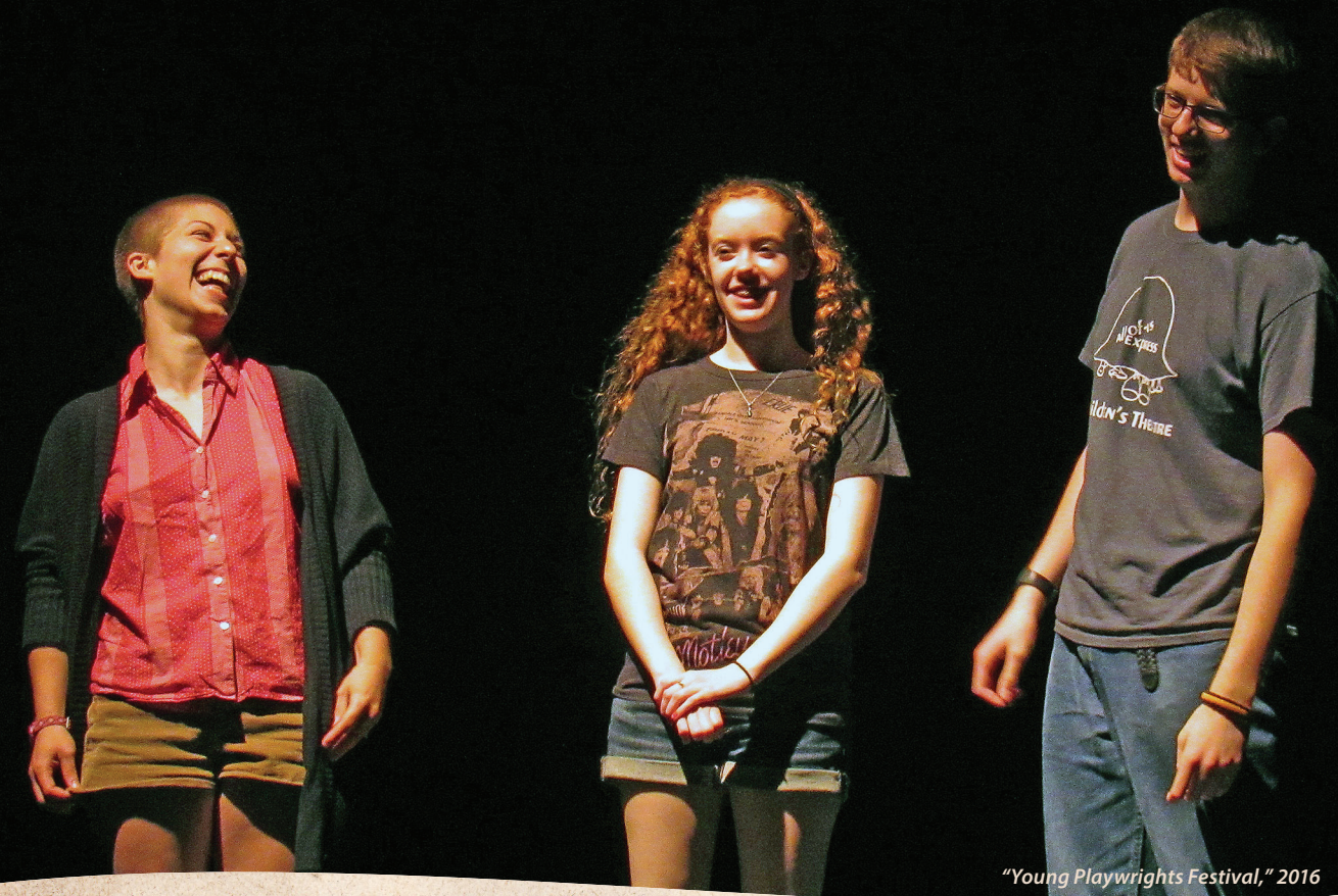
"Young Playwrights Festival," 2016